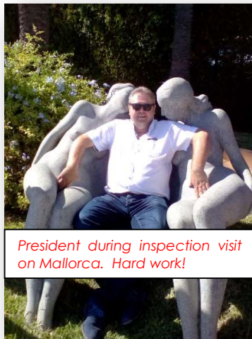
President during inspection visit on Mallorca. Hard work!

Marketing in 2018 will be influenced by the absence of an international used machinery exhibition.